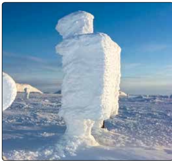
• Winter view of the above installation.*