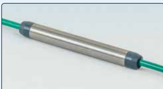
• Close-up of an encapsulated sensor from the Model 3810A (Addressable) Thermistor String.