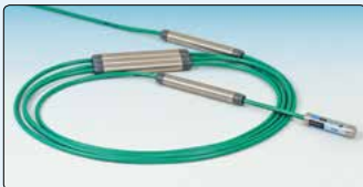
• Model 3810A (Addressable) Thermistor String, shown with 5 sensors.