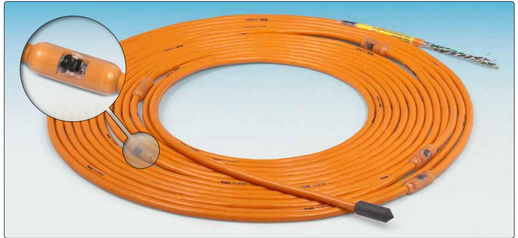
• Model 3810 Thermistor String (inset shows a close-up of an encapsulated sensor).