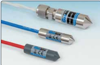
• Model 3800-1-1, Model 3800-2-1 and Model 3800HT Thermistor Probes.