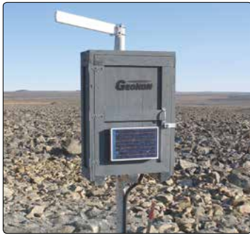
• Summer view of the GEOKON® Model 8025 Data Acquisition Station measuring a 70 m deep Thermistor String in mine tailings, located in northern Canada.*