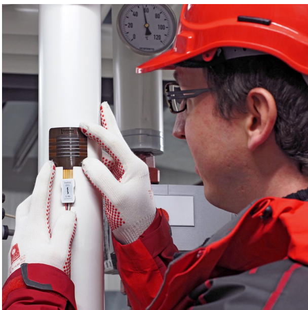
Figure 2 FHF02 being installed on a pipe