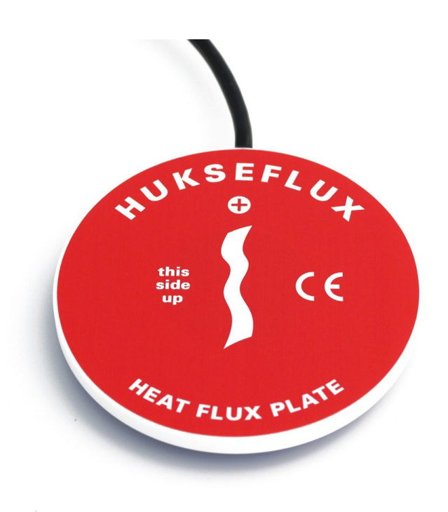
Figure 1 HFP01 heat flux plate; the opposite side has a blue coloured cover

HFP01 is the world's most popular sensor for heat flux measurement in the soil as well as through walls and building envelopes. The total thermal resistance is kept small by using a ceramics-plastic composite body. The sensor is very robust and stable. It is suitable for long term use on one location as well as repeated installation when a measuring system is used at multiple locations.