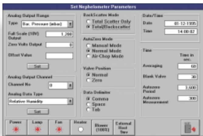
Software makes it easy to set up the Model 3563.

Model 3563 includes software that provides the tools needed to set up the instrument, check instrument status, start and stop data collection, and view data. The software enables you to display data records in a polled format that is easy to interpret. It also stores data in an unpolled format to a specified file.