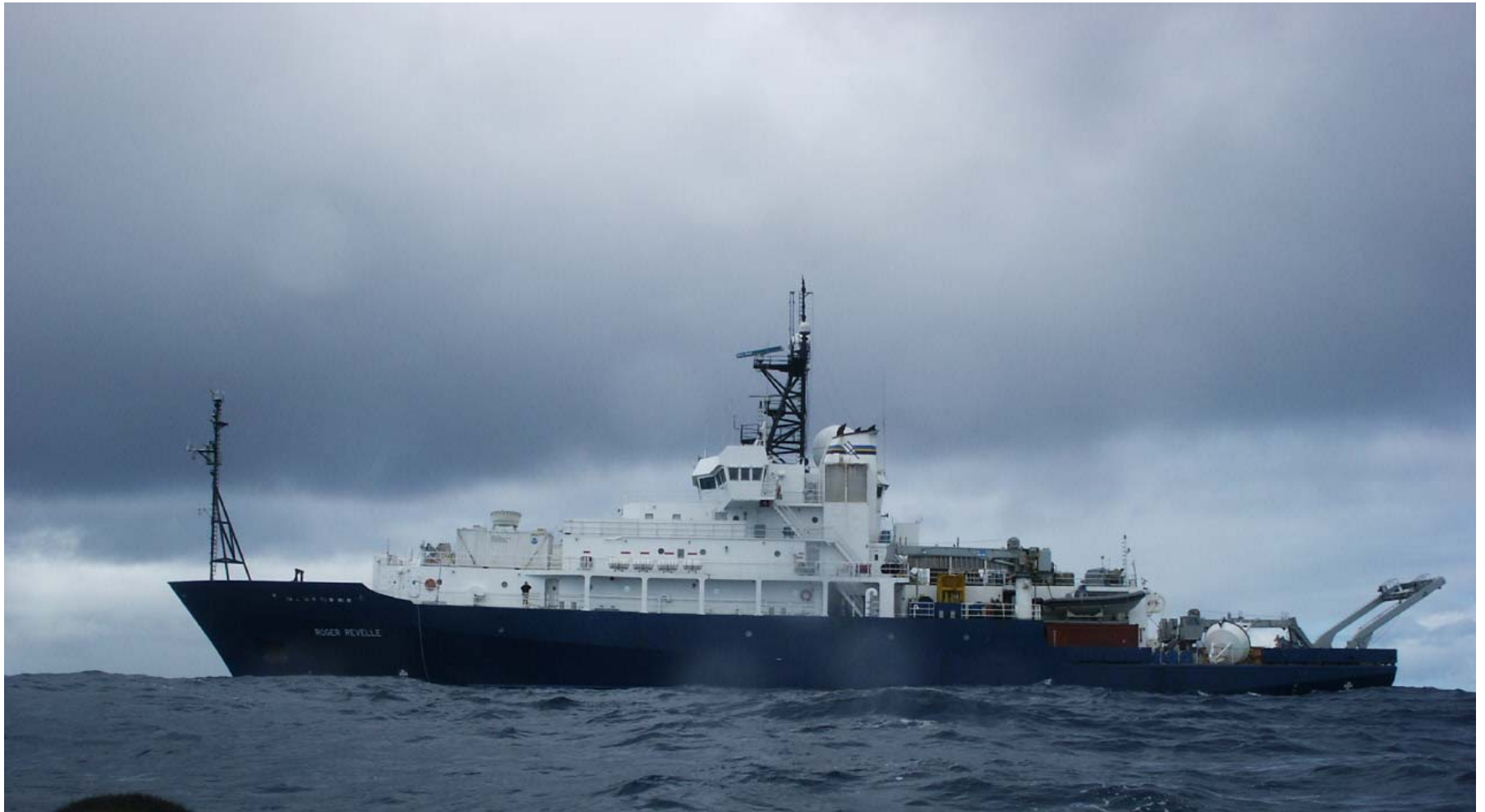
Figure 1. The Scripps Oceanographic Institution Research Vessel Roger Revelle at 20 S Latitude 85 W Longitude supporting NOAA's Ocean Observations and Climate Variability programs. ETL's seagoing flux system is on the mast on the buoy; the cloud radar and microwave radiometer container is forward on the second white level. The replacement WHOI climate buoy is the round white object sitting low on the stern.